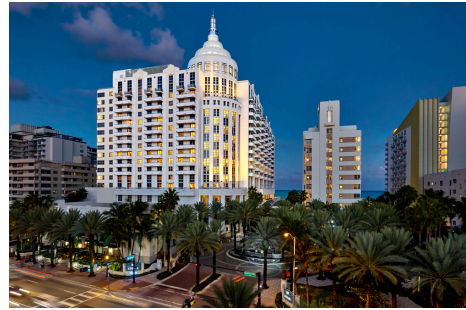
Loews Miami Beach Hotel 1601 Collins Avenue Miami Beach, FL 33139 www.loewshotels.com/miami-beach