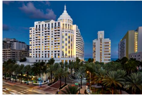
Loews Miami Beach Hotel 1601 Collins Avenue Miami Beach, FL 33139 www.loewshotels.com/miami-beach

Transportation by shuttle or limousine to both airports can be arranged by the hotel concierge.